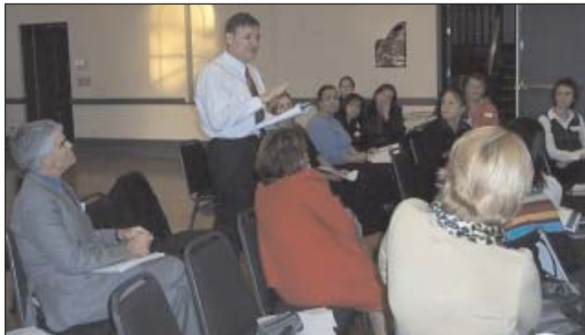
The Commission often consults with the community